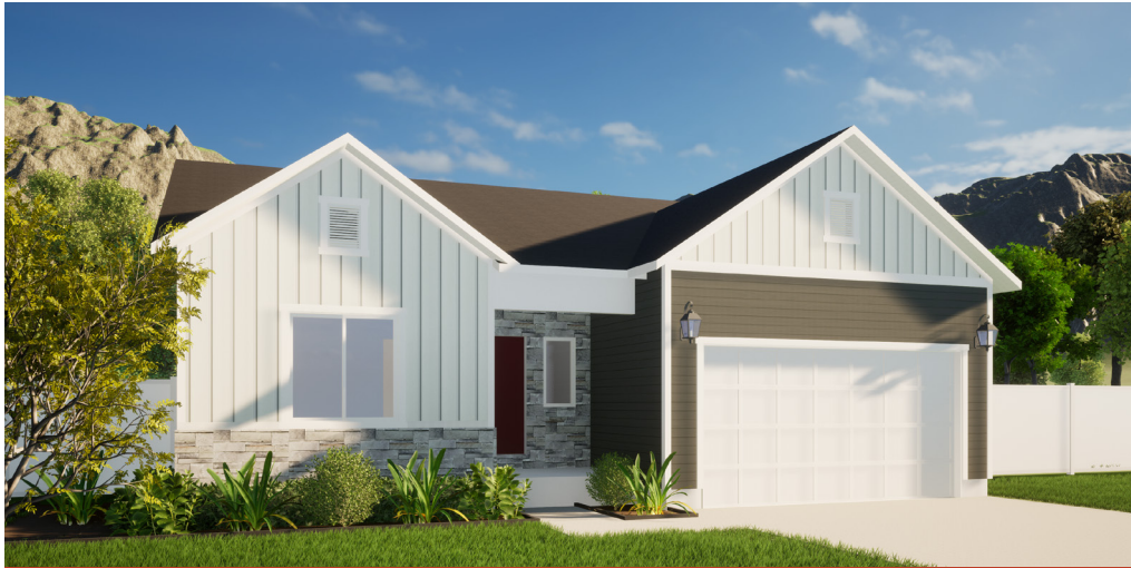
Elevation A: Traditional