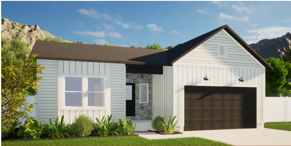
Elevation B: Farmhouse